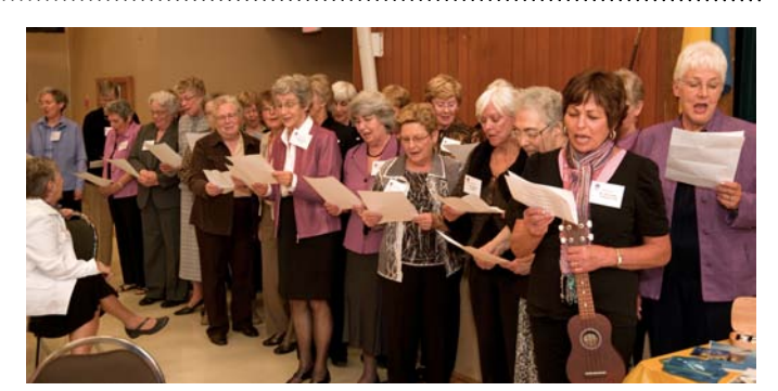
Class of August 1960 "Singing their hearts out" at the Luncheon

Uganda, Ghana, Tanzania and other countries. For more information visit: <u>www.rwhn.org</u>