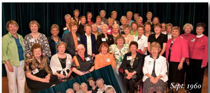
More photos on the website