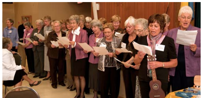
Class of August 1960 "Singing their hearts out" at the Luncheon