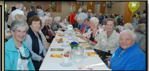
"THE' number was Trinity6 3211