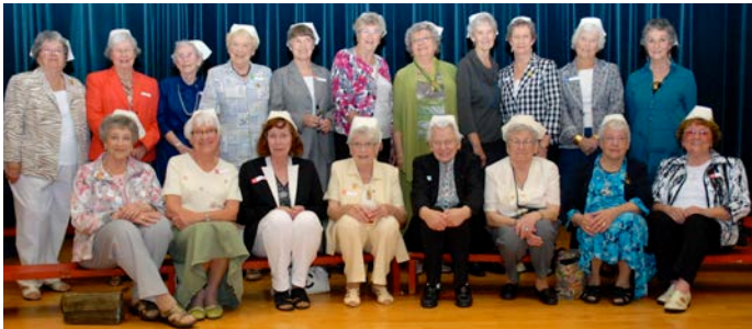
Class of Feb. '53 alumnae celebrating their 60th reunion at the 2013 spring luncheon.