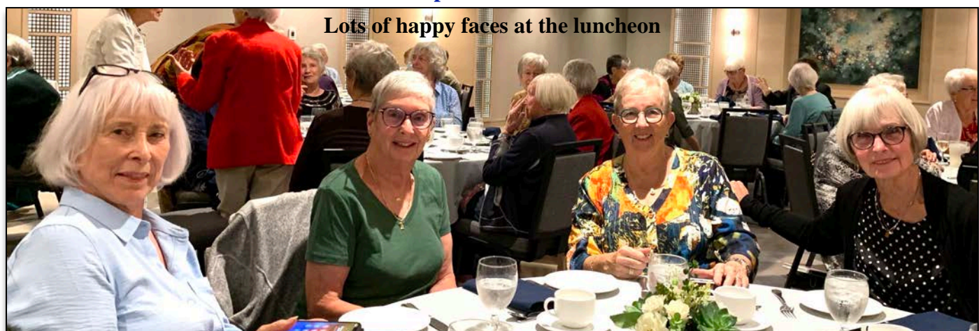
Lots of happy faces at the luncheon