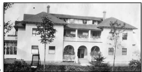
East section of the Old Home on 10th & Heather St.

VGH’s footprint too has dramatically changed. Our first residence was the Old Home on the second floor . I was in a dorm with six others on the top floor. We probies immediately bonded, and those roommates became lifelong friends. Some time after we earned our caps we were moved to the 1915 Home, a ‘heritage like’ building, on 12th and Heather into a two bed room. The bedtime game there was keeping the light off until you could position yourself partially hanging head first off the bed holding a slipper. The object of the game was to kill as may silverfish as you could with your slipper when the lights came on.