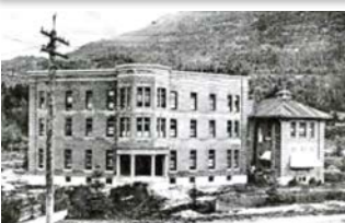
Queen Victoria Hospital

After my two year posting I travelled the world with my friend. The entire